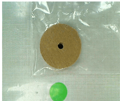
View of content (1mm x 1mm scale)