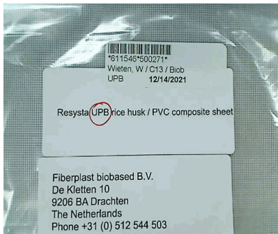
Package received - labeling COC

Laboratory Number Beta-611546 Percent modern carbon (pMC) 27.40 +/- 0.11 pMC Atmospheric adjustment factor (REF) 100.0; = pMC/1.000